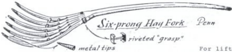
Six-prong Hay Fork Penn

For lifting barley from one place to another.